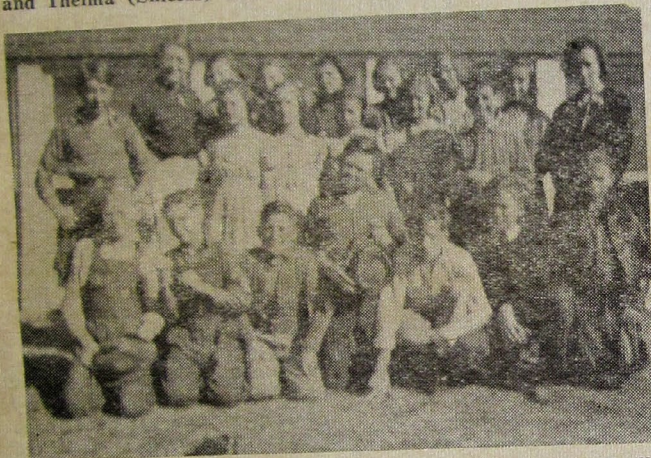
Remember the 7th grade? This group of youngsters finally became the class of 1944 of the Arnold High School. How many do you recognize? —Taken from original print