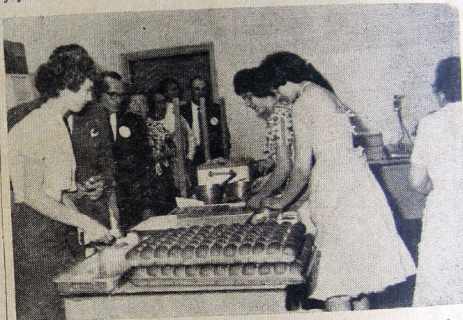
The class of 1953 celebrate their 10th anniversary at last year's banquet. Here some of them file through the new kitchen cafeteria.