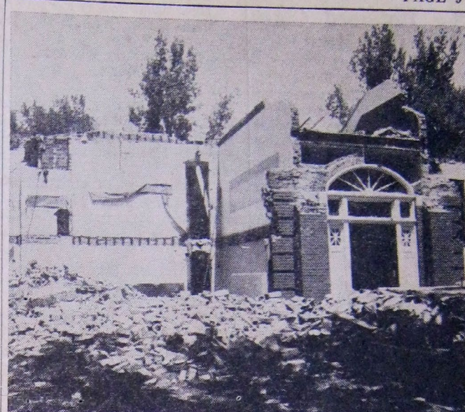
Remains of the old grade school. Contents of the corner stone will be on display at the banquet this year.