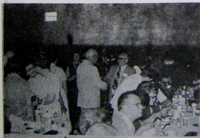
Eatin' and talkin' and talkin' and talkin' - -