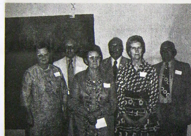
Class of '33 - - "We always were on the serious side."