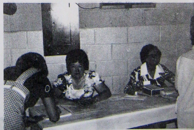
"Sign here, please, and have a good time!"