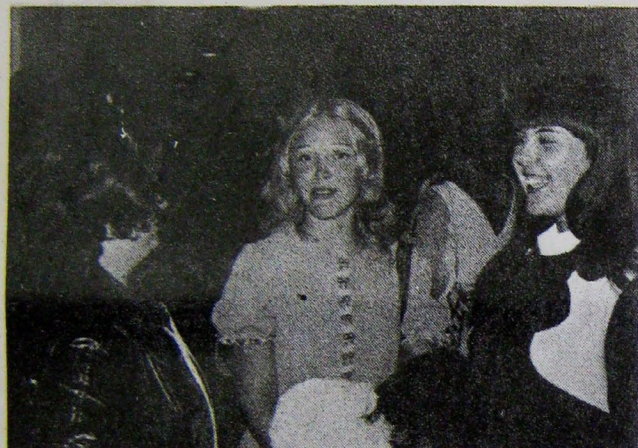
"We may be young, but we have a good time!"