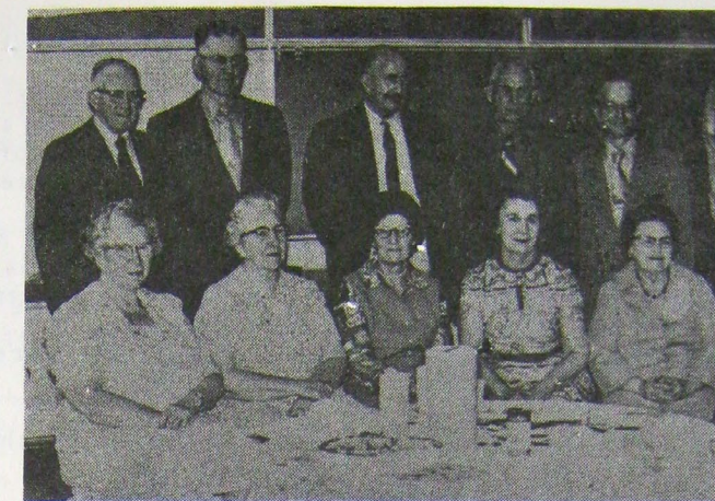
"Don't we look GREAT fifty years later?" Class of '23