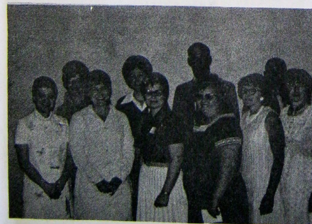
Class of '53 - "Well, it's only been 20 years."