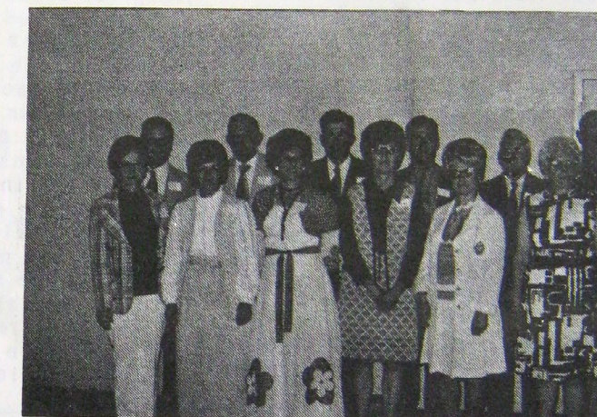
"We're the Class of '43 - - We're the BEST - don't you agree?"