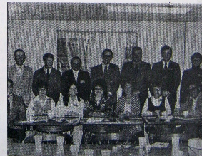
"For a gay old time see the Class of '63."