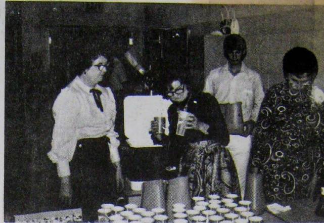
The hostesses - and a junior server - working hard the night of the Banquet.