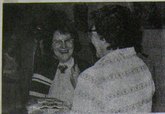
"Are we having a good time?" "ABSOLUTELY!"