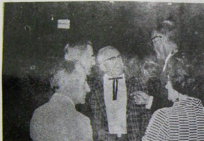
"It was just like this! I know, I was there!"