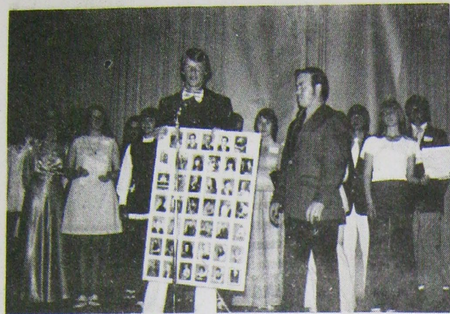
The Class of '73 presenting their class picture to the Alumni Association.