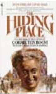
The Hiding Place By: Corrie Ten Boom