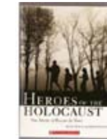
Heroes of The Holocaust By: Allan Zullo