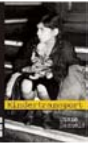
Kindertransport By: Olga Levy Drucker