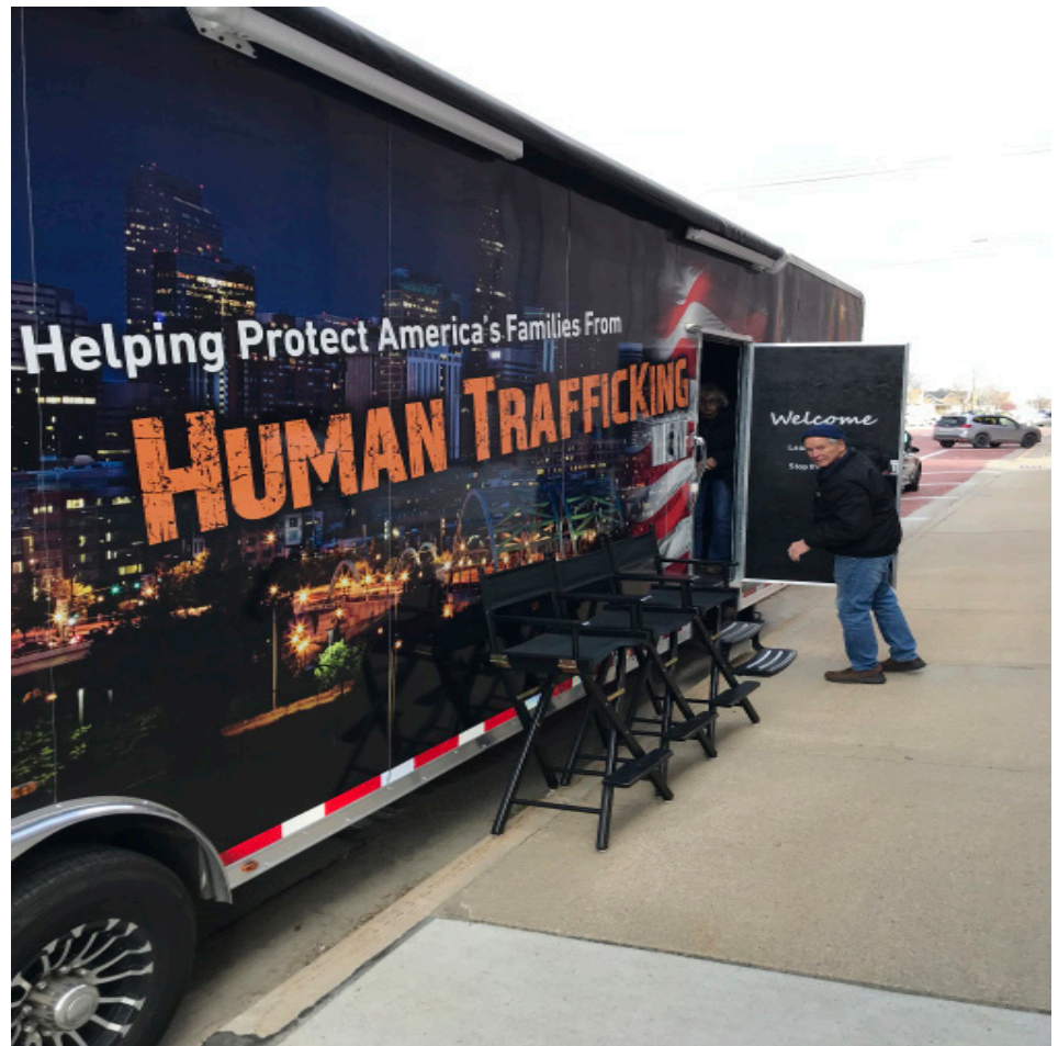
Shown above is the trailer that the human trafficking awareness company brought to Broken Bow. Students got the opportunity to walk through the trailer and learn about two young girls who were abducted by human traffickers.

All in all, this presentation was a new and interesting experience for APS students. It gave them a whole new perspective on the human trafficking business and educated them well about the signs and what to look out for when it comes to the trafficking of humans.