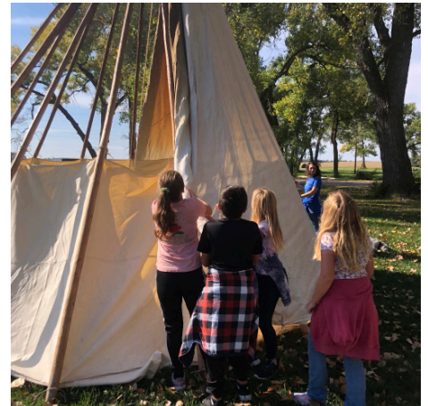
Fourth Grade Students helping lay out the covering for the tipi.

so much meaning. They especially loved being able to sit inside once everything was put together. This fun project really was an opportunity to open their eyes about the Native's true lifestyle and how much work it was.