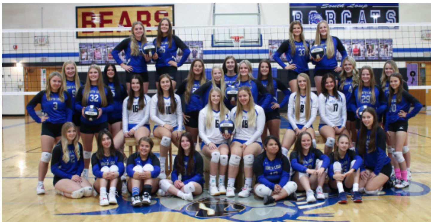
Pictured above is the 2021 South Loup High School Volleyball Team.