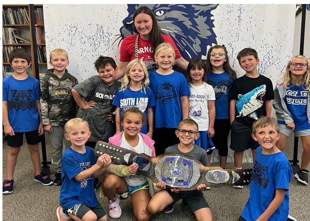
1st Grade were the winners of week two!