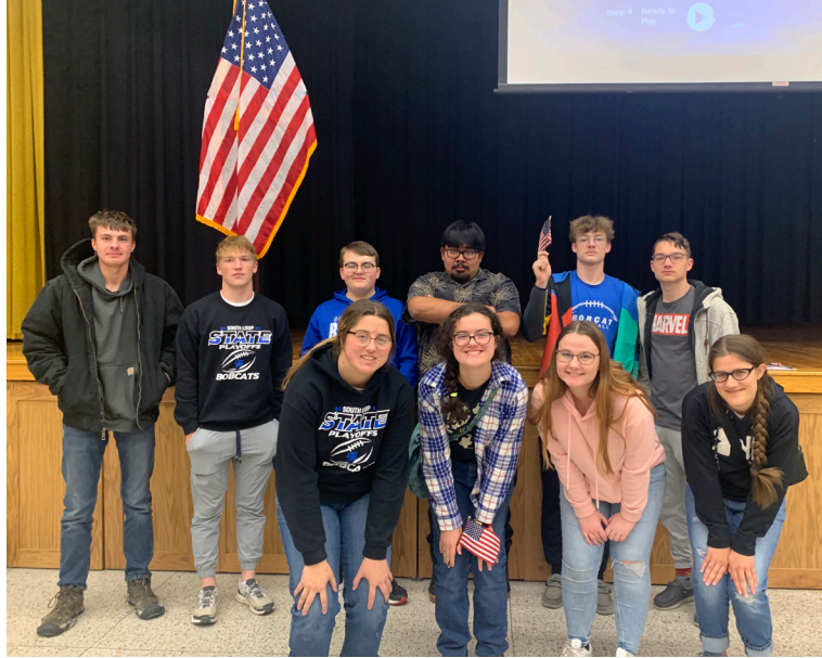
Senior Students from Arnold Public School at Broken Bow Municipal Building.