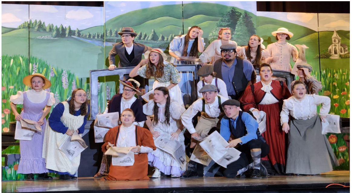
Arnold One Acts performing Anne of Green Gables at MNAC.

The upcoming Districts competition will be held in Thedford, Nebraska on Wednesday, November 29th as Arnold continues their hopeful journey to the State competition held