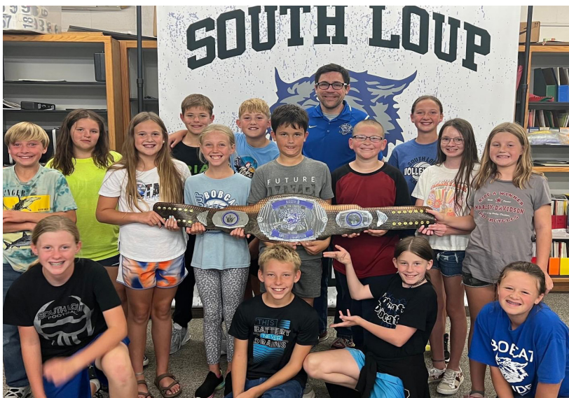
Fifth Grade were the very excited winners of week 3!