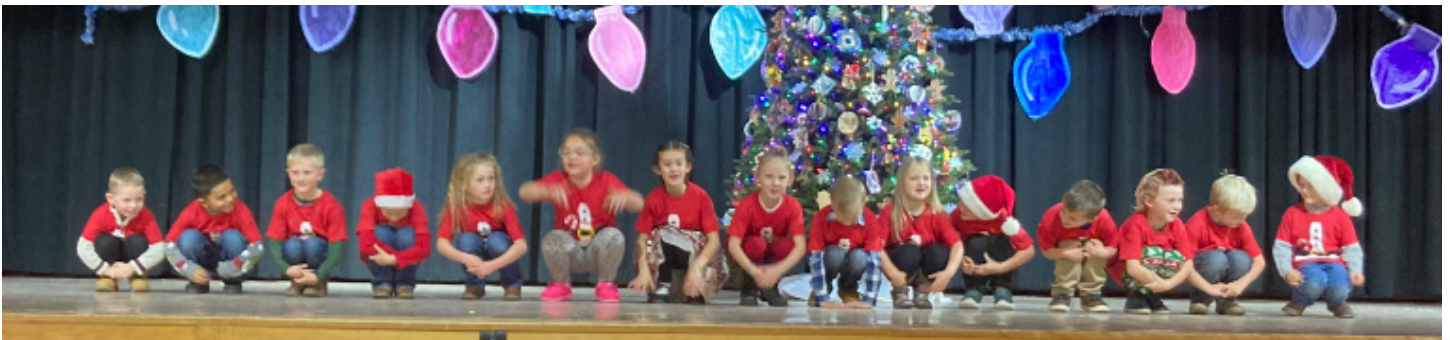
The Kindergarten Class performs with an abundance of holiday spirit.