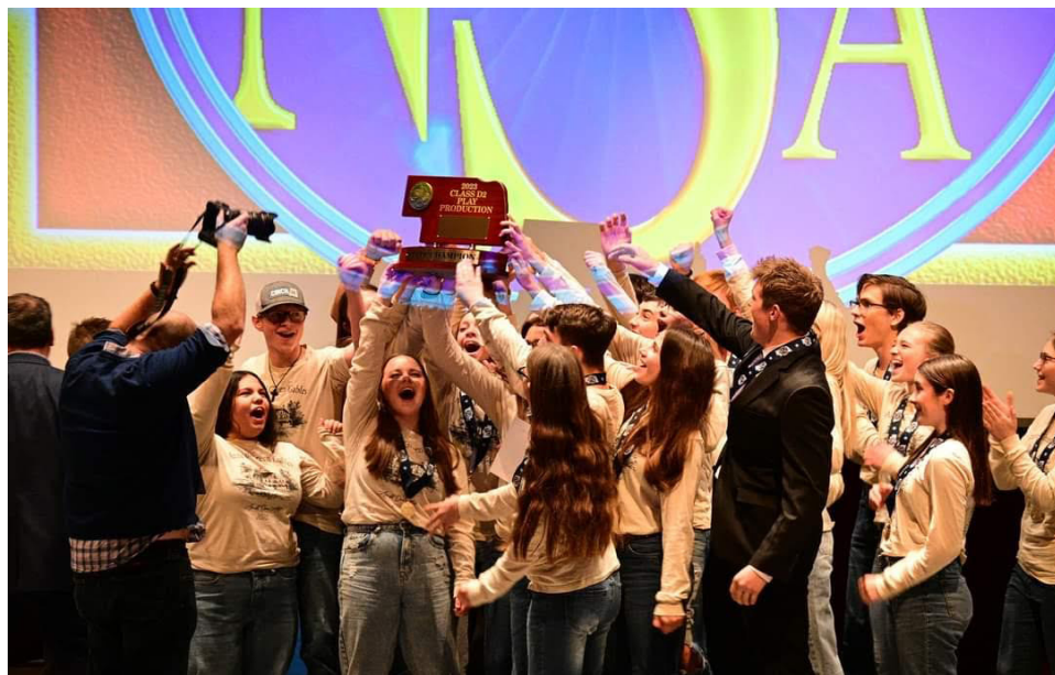
Arnold One Act Team celebrating and holding the D2 Play Production State

work well together and make every day fun. I am so excited to take this delightful group of students to perform at State. A well deserved honor for this hard working team.”