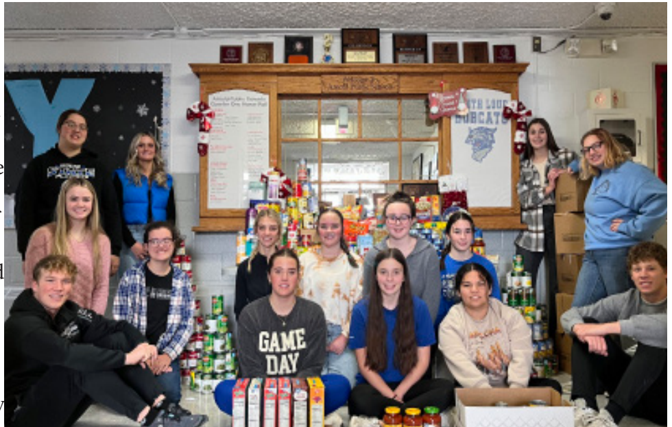
National Honor society Students with the boxes and boxes of food before loading it up and taking it down to the food pantry.

On Tuesday, students continued to add items to the total, but it still didn't look like the school would reach the goal. The students and teachers still had high hopes but couldn't help but doubt. They were hoping they could pull it to-