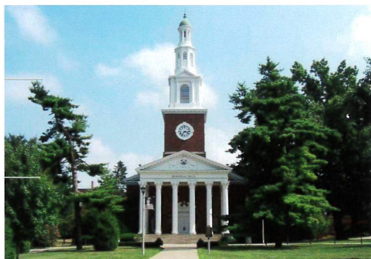
University of Kentucky