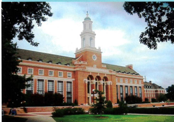
Oklahoma State University

About 50% of eligible applicants are awarded scholarships, the highest award percentage of any national scholarship. If you meet the eligibility requirements you should apply for a scholarship. The award of a Hagan Scholarship has been life-changing for many recipients.