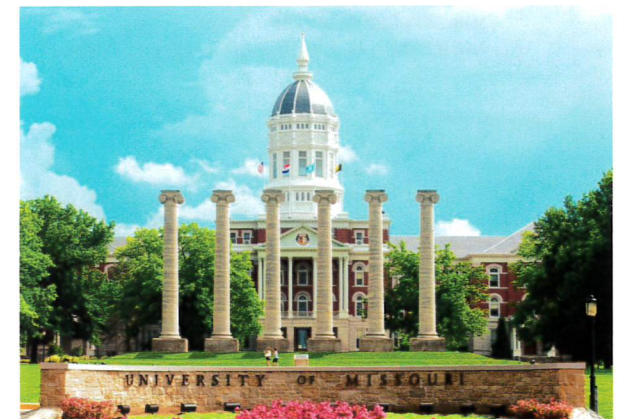
University of Missouri-Columbia

The Hagan Scholarship is a nationwide need-based merit scholarship designed to help rural students graduate college debt-free. Recipients must have financial need and must graduate from one of over 6,000 eligible public high schools listed on the HSF website. The scholarship provides up to $48,000 over four years to attend college and other benefits. Hagan Scholars from 43 states are currently attending 378 colleges and universities. Over six hundred more scholarships can be awarded in April 2022. Visit the HSF website for more information.