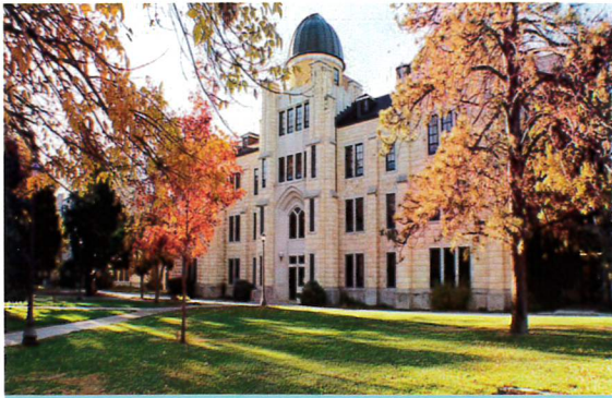
Fort Hays State University